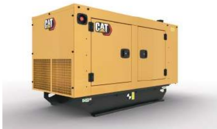
Image shown might not reflect actual configuration